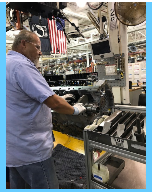
Machine operator installing crankshaft & bearings at the Detroit Diesel Factory