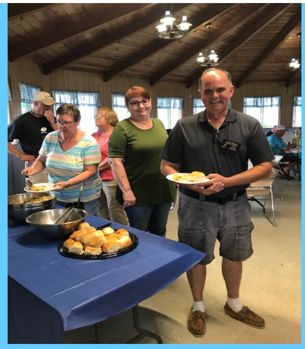
Guests enjoying our first night's dinner

Tuesday, July 17 began with a hearty catered breakfast and then we were off for Greenfield village and the Ford F-150 plant tour. We began our second day at the Ford campus with a free bus ride from the Ford museum to the plant. I had never seen a plant, so watching from high above the production line, the operation of making a truck was fascinating. The workers had no downtime at all. They had strict schedules of breaks and lunch.